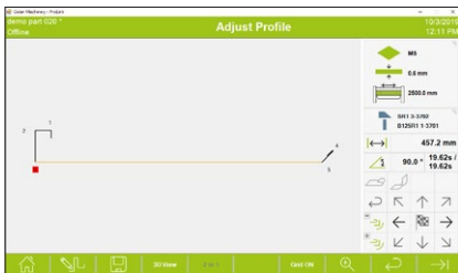
Draw your own profile and set the measurements, angles and values for radial bending.

ProLink W is Windows based and can be linked to your network. You can also upload programs using QR code readers. With the planning tool Production from nuIT you get the profiles dimensioned directly in your system and you can even upload most file formats and construct bending programs this way.