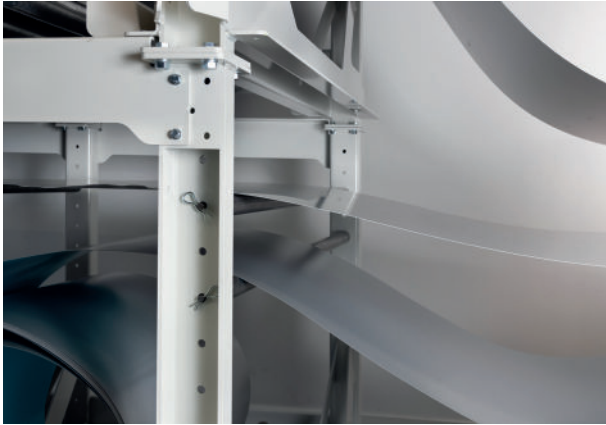
The guide rollers are movable in height, lifts up the sheet and create distance so that you avoid scratches in the lacquer layer.