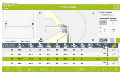
This function automatically calculates bending sequence, analyses possible collisions and provides information in graphic display for the operator.