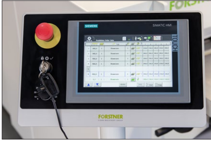
The control touch screen has uncomplicated and user-friendly commands. Here you control all the functions of the machine.