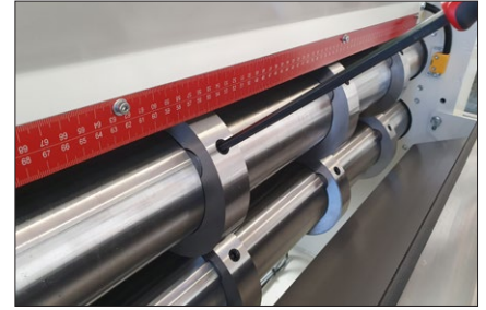
5 Sets of slitting knives come standard on the Compact series slitters. The unique "Cap-Locking" system gives you trouble free slitting the life of the machine.