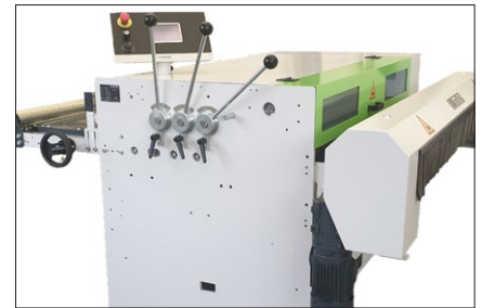
The coil guide is an important component for the function and accuracy of every system. The table has fixed and a manually adjustable coil guide with ball bearings. The adjustment of the movable coil guide is done by a hand wheel. This specific table has rollers integrated in the table to ensure a smooth surface.