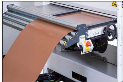
The table guide has four roller bearings (two on each side) to guide the metal in the pinch rolls. The roller bearings allow the metal to move easily forward and backwards without damaging the edges. This also keeps the material straight as the material is fed into the machine helping to ensure a square cut.