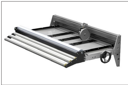
The infeed guide rollers are angled to match the loop of the coil from a decoiler. This helps prevent creasing on soft materials like copper, aluminum and zinc. Another helpful feature is guiding the coil into the infeed guides. Between the slitter and shear are roller guides to ensure the material guides into the shear without curling up.