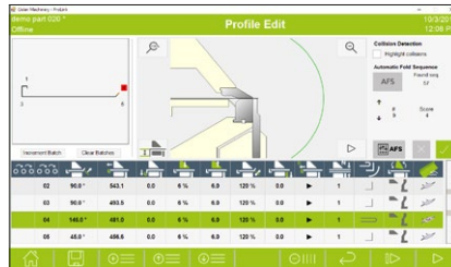
This function automatically calculates bending sequence, analyses possible collisions and provides information in graphic display for the operator.