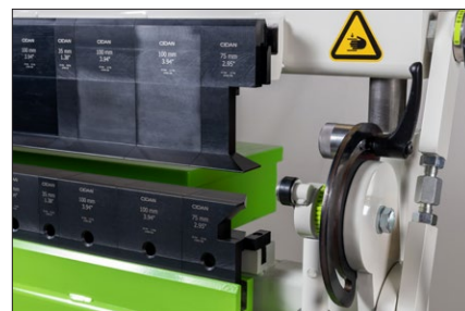
Corner tools as standard for maximum flexibility. Tool height in lower beam is 2.36" and the tools in the folding beam are 3.7" high.