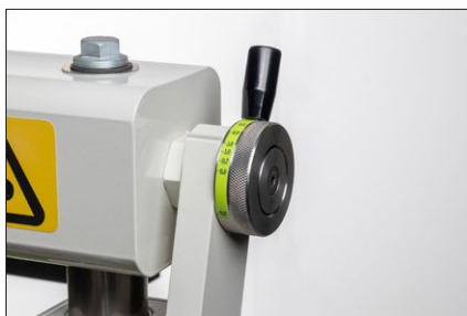
Clamping pressure adjustment for best results and an easy way to operate.