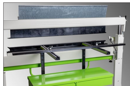
The T-groove back gauge allows flexible set-ups and great repeatability. Max back gauge depth 23". (Option)