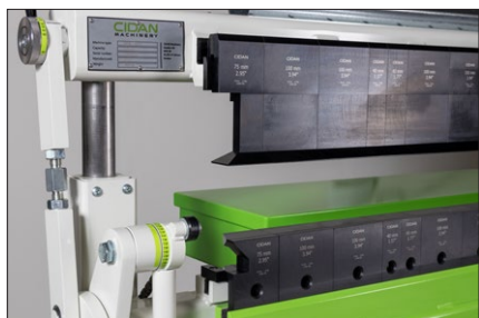
3.93" high divided, high quality quick-change tooling all the way. Generous opening height of clamping beam of 3.93".