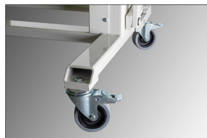
Wheels as standard, lets you move your folder with ease.