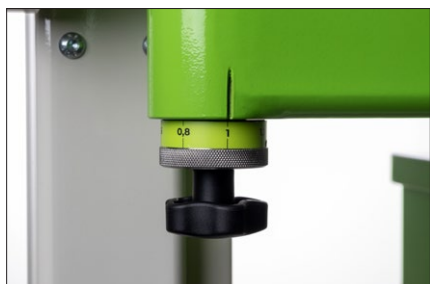
Adjust the sheet thickness on the fly to get perfect results.