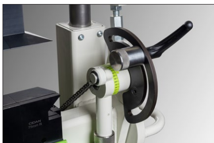
Easy setting of folding angles with bending angle stop.