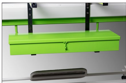
A smart storage box for tools and divided box tooling is standard.